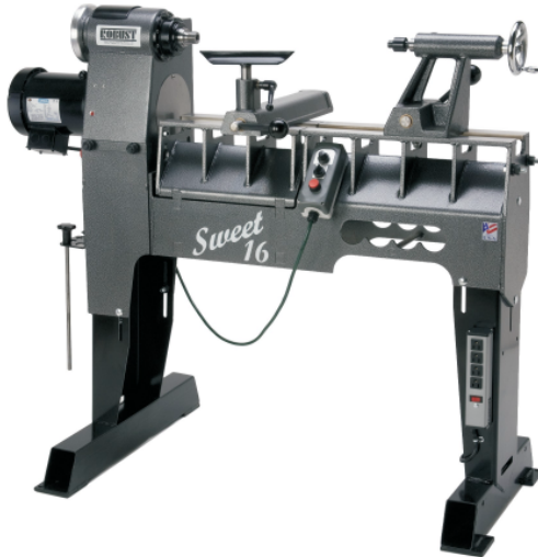
Above: Short bed Sweet 16 as a normal 16" x 26" lathe (long bed is 16" x 38").

Converts to a any of these three configurations in under a minute!