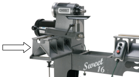
Above: Remove the gap bed and re-position it on the headstock to convert the Sweet 16 into a 32" bowl lathe.